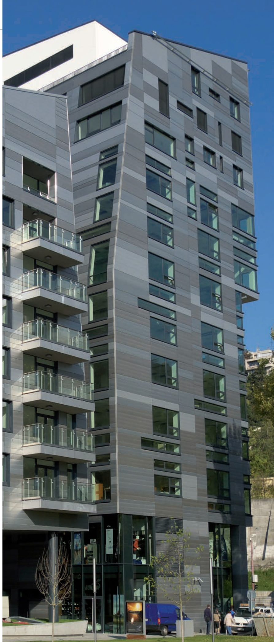
Right : River Park, Bratislava, Slovakia Product : MPF 150F/200F in 3 colours Architect: Erick van Egeraat

Excellent pre-treatment and a colour-stable coating is not enough to produce a product that performs well; The right aluminium alloy is equally important. In order to reach the optimal durability level, Hunter Douglas utilizes a highly corrosion-resistant aluminium alloy type - EN AW 3005 or equivalent.