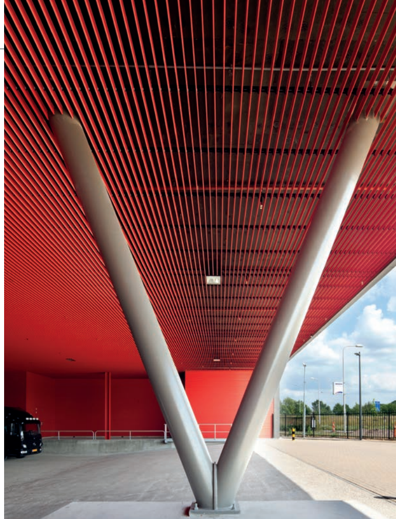
Below : Weena Tunnel, Rotterdam, The Netherlands Product : Exterior Ceiling Architect: Maarten Struijs