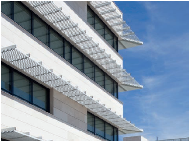
▲ SUN LOUVRES